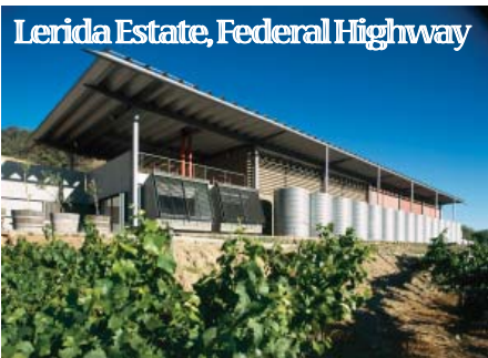
Lerida Estate, Federal Highway